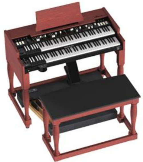
Viscount Legend Soul (currently top dog)