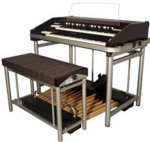
Hammond-Suzuki B3-MK2 portable